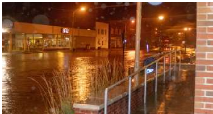
These pictures were taken by Steve Buckland, Chief of Police, during the flooding of Rich Creek on Main Street, September 22, 2018.