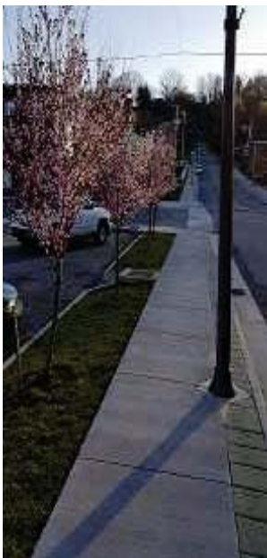
The new trees and flowers blooming on Main Street