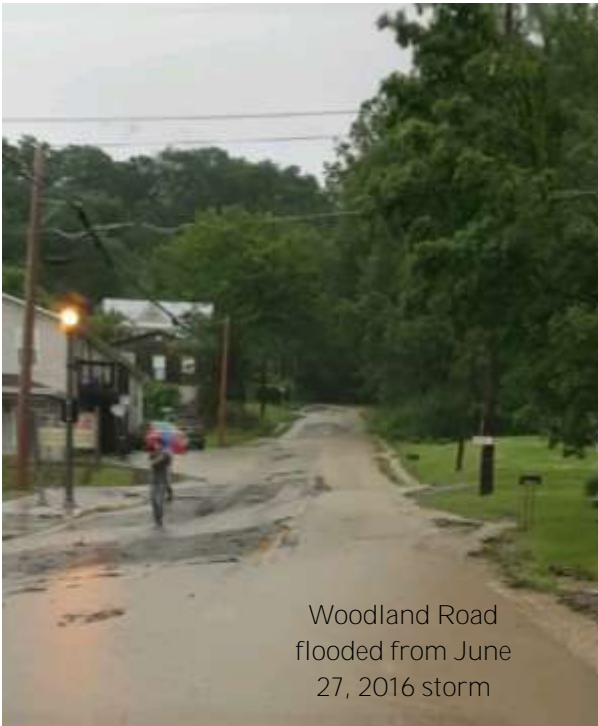
Woodland Road flooded from June 27, 2016 storm

If you would like to become a fire fighter and you live in the Rich Creek, Glen Lyn, Narrows, or Peterstown area, meetings are held every Monday at 7:00 PM.