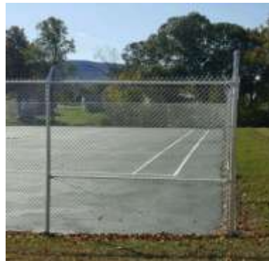
New shelter added at Woodland Park, flag pole and tennis courts are currently under renovations